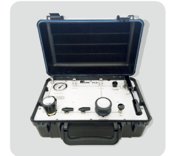
Portable Pneumatic Pressure Generator / controller (Model : PCS-PC)