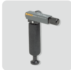
Low Pressure Hand Pump (Model : 700LTP-1)