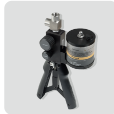
Hydraulic Hand Pump (Model : 700HTP-2)