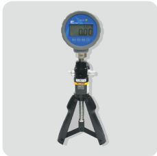
Pneumatic Hand Pump (Model : 700PTP-1)