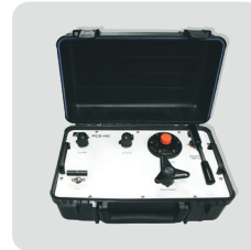
Portable Hydraulic Pressure Generator / controller (Model : PCS-HC)