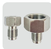
Quick adaptor 2 M14 x 1.5, M20 x 1.5 Female Metric set 2 ea