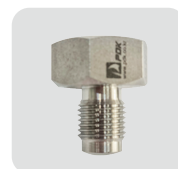
Quick adaptor 3 High pressure 9/16" UNF F Cone Threaded