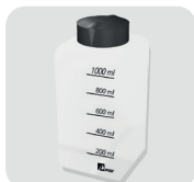
External reservoir 1L