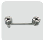
External pressure manifold