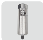
Liquid to Liquid separator OWS-100 (Max 1000 bar, 22 cc)